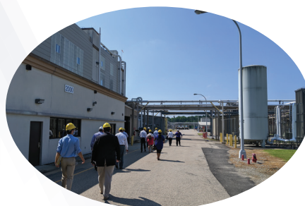
VGR and Regional Leaders Tour Petersburg AMPAC Facility