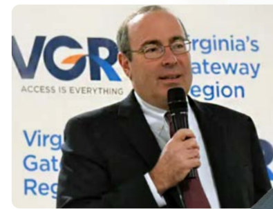
Federal Reserve Bank of Richmond President & CEO Thomas Barkin

Federal Reserve Bank of Richmond President & CEO, Thomas Barkin, visited the region in February to provide an update on the U.S. economy, particularly amidst the uncertainties occurring around the globe and the lingering impacts of the COVID-19 pandemic. Mr. Barkin offered a sense of hope and reality as he spoke at a luncheon hosted by VGR at the Keystone Antique Truck and Tractor Museum in Colonial Heights. He said the U.S. economy is strong enough and inflation is high enough that adjusting interest rates towards pre-pandemic levels is possible. Mr. Barkin also pointed out how the nation's economy is already larger than it was before COVID-19 entered our lives, as evidenced by the Advanced Pharmaceutical Manufacturing cluster taking root in Petersburg.