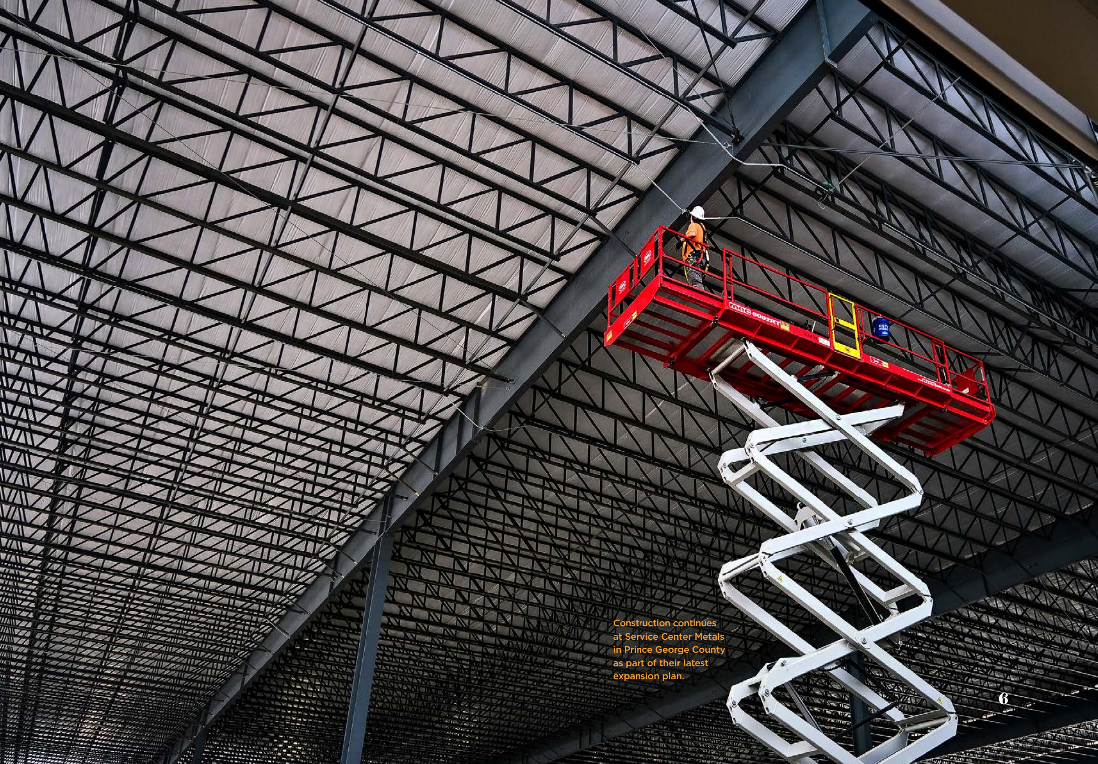
Construction continues at Service Center Metals in Prince George County as part of their latest expansion plan.