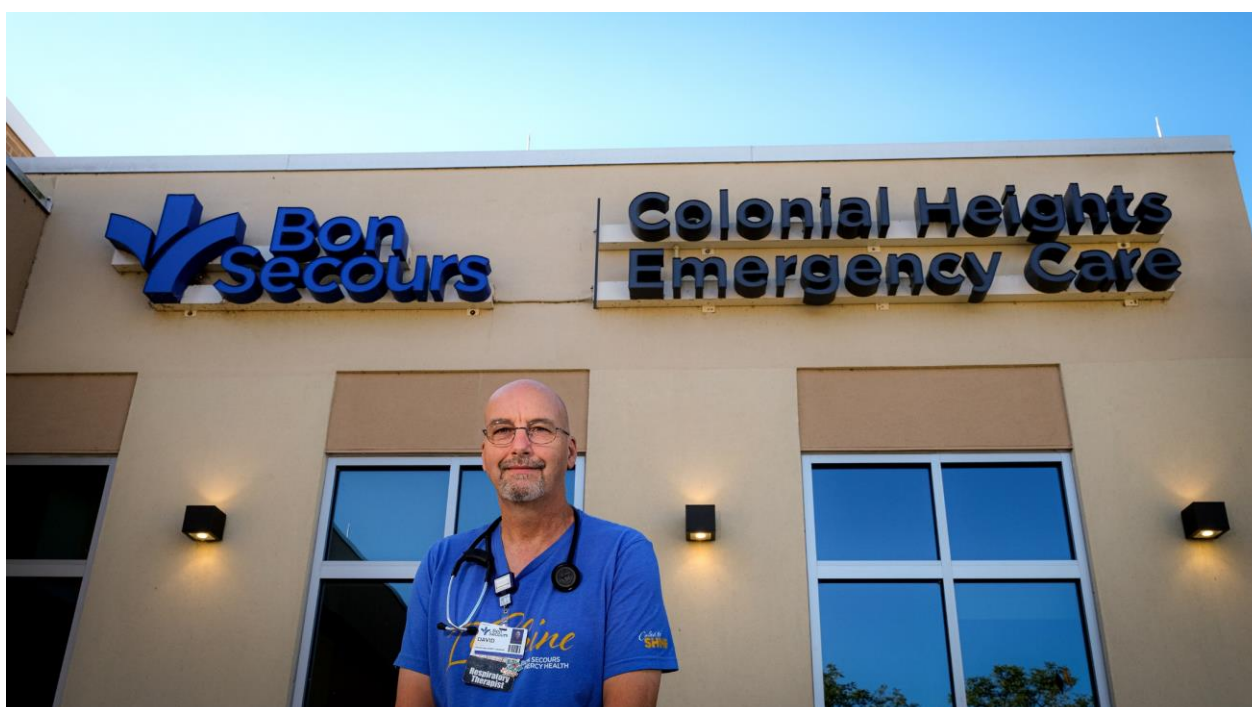
Bon Secours Emergency Care Clinic

**** Public library data from the Institute of Museum and Library Services (imls.gov) and academic library data from IPEDs (the Integrated Postsecondary Education Data System, nces.ed.gov)