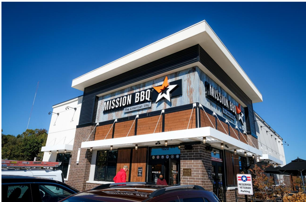
Mission BBQ - Colonial Heights, VA

Cultural attractions can be found throughout the region, including the Virginia Museum of Fine Arts.