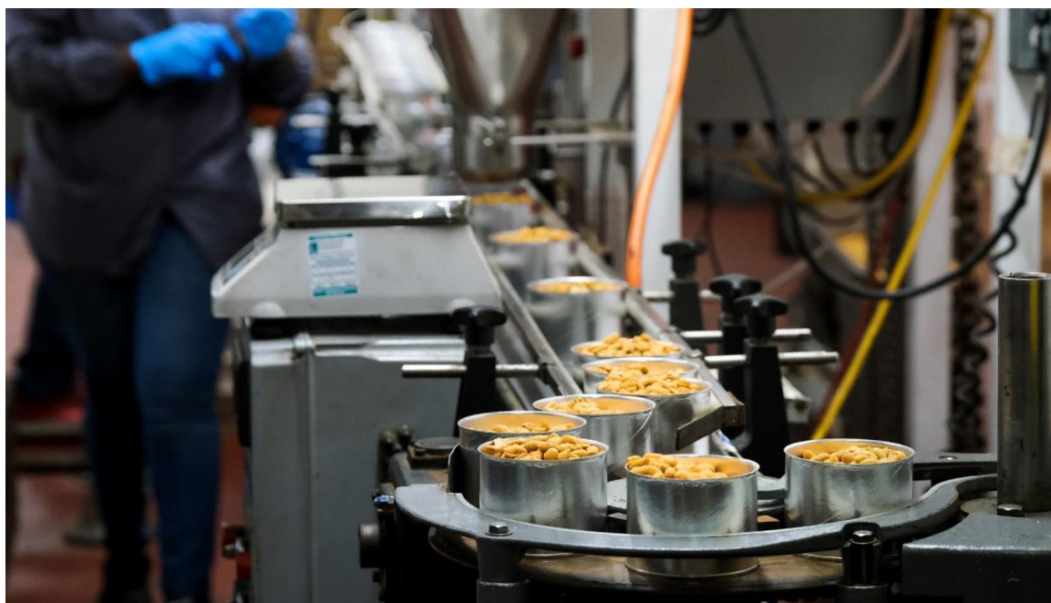
Virginia Diner Production, Sussex County Virginia

*** Public library data from the Institute of Museum and Library Services (imls.gov) and academic library data from IPEDs (the Integrated Postsecondary Education Data System, nces.ed.gov)