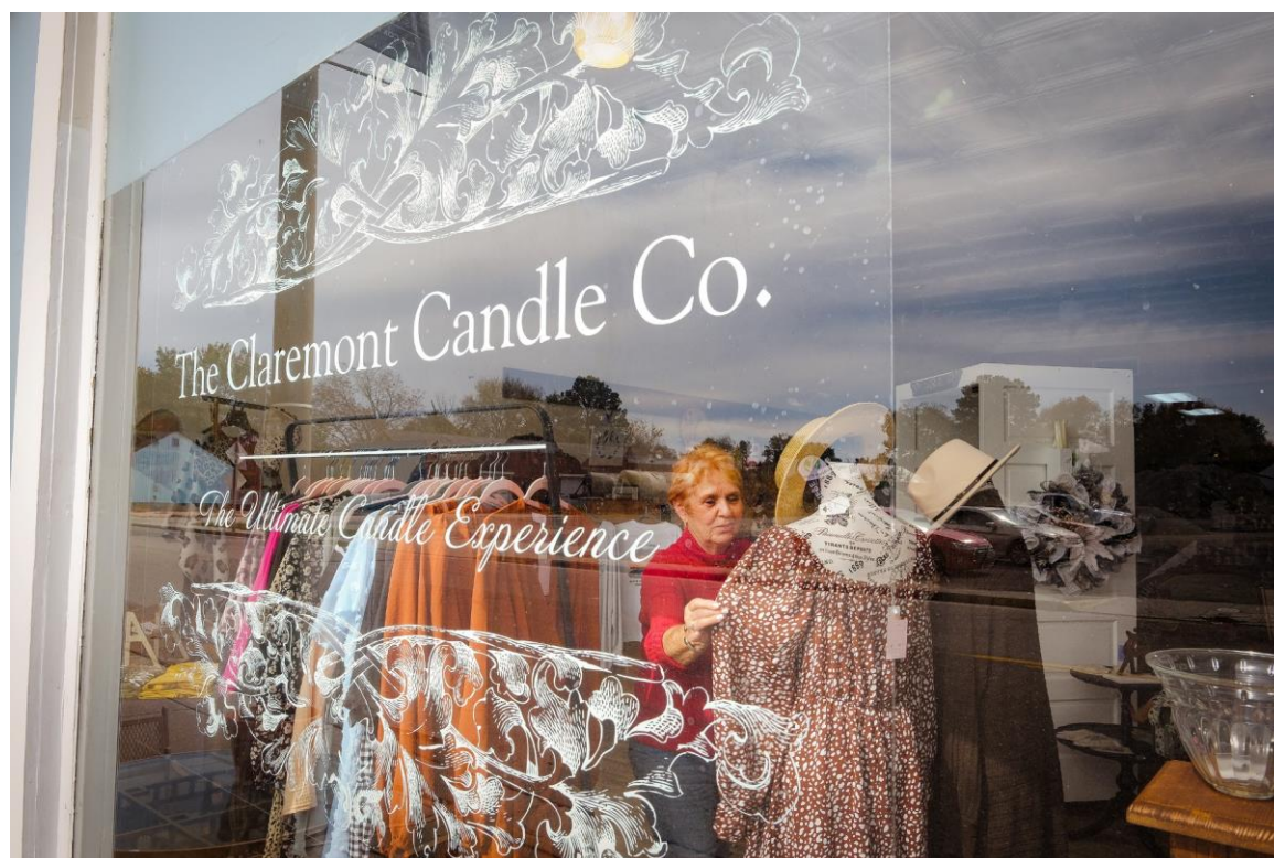
The Claremont Candle Co., Sussex County, Virginia

Sussex County is centrally located between Williamsburg, the Richmond metropolitan area, and the Virginia Beach-Norfolk-Newport News metropolitan area. This central location enables county residents to easily access the numerous recreational, historical, cultural, educational, and entertainment attractions these diverse areas have to offer. Area attractions include the historical sites and museums in Colonial Williamsburg; Busch Gardens - a theme park near Williamsburg; the Chrysler Museum in Norfolk; Seashore State Park in Virginia Beach; and numerous championship golf courses located throughout the region.